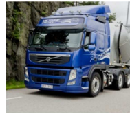
Volvo FM MethaneDiesel 460HP, 2300Nm (dual-fuel) Euro VI expected Q3 2015