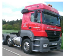
Hardstaff Mercedes Benz Actros Up to 480 HP, 2300Nm (dual-fuel) Euro VI expected Q3 2014